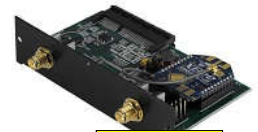
BLE + XBee