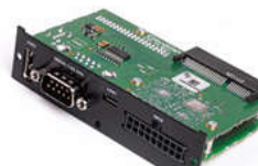
Telematics + CAN + I/O