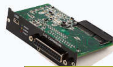
PLC + Data Logger + I/O