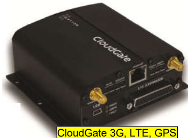
CloudGate 3G, LTE, GPS