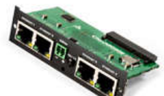
4-port Ethernet PoE