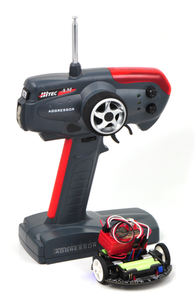
A radio-controlled 3pi with an RC transmitter.

The 3pi robot [http://www.pololu.com/catalog/product/975] is complete mobile platform designed to excel in linefollowing and maze-solving competitions. The 3pi has user accessible I/O lines that can be connected to different sensors to expand its behavior beyond line-following and maze-solving. This project shows one possible configuration where a two-channel radio-control (RC) receiver connected to the 3pi enables manual operation of the platform with minimal soldering. Many other sensors could be used to expand the 3pi, including distance sensors to make a wall-following robot. [http://www.pololu.com/docs/0J26]