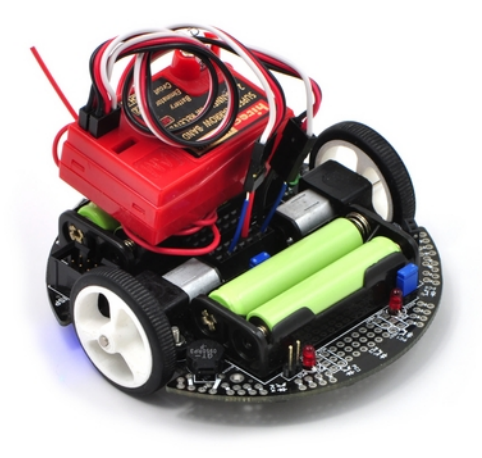
A radio-controlled 3pi.