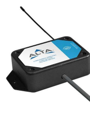
AC Voltage Sensor