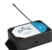
Monnit™ Environmental Sensors