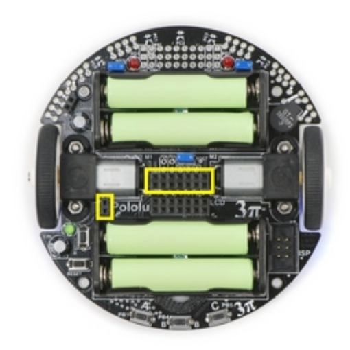
Pololu 3pi robot with expansion kit female headers marked by yellow rectangles.

1) Place the 2x7 female header and one of the 2x1 female headers into the proper holes in the 3pi base as shown below (see the yellow rectangles).